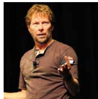
Alistair Cockburn "Agile is for Wimps: Top-Level Software Development in the 21st Century"